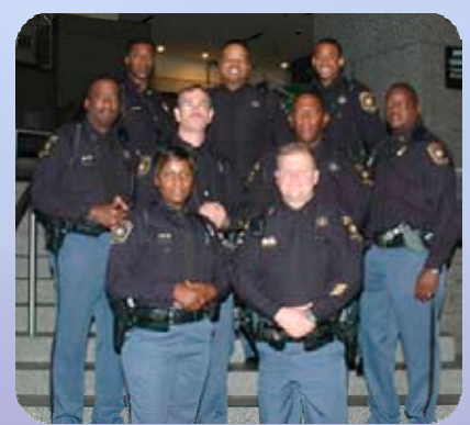
North Civil Division