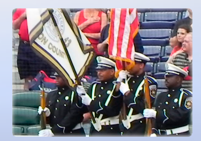
Atlanta Braves - May 1, 2010