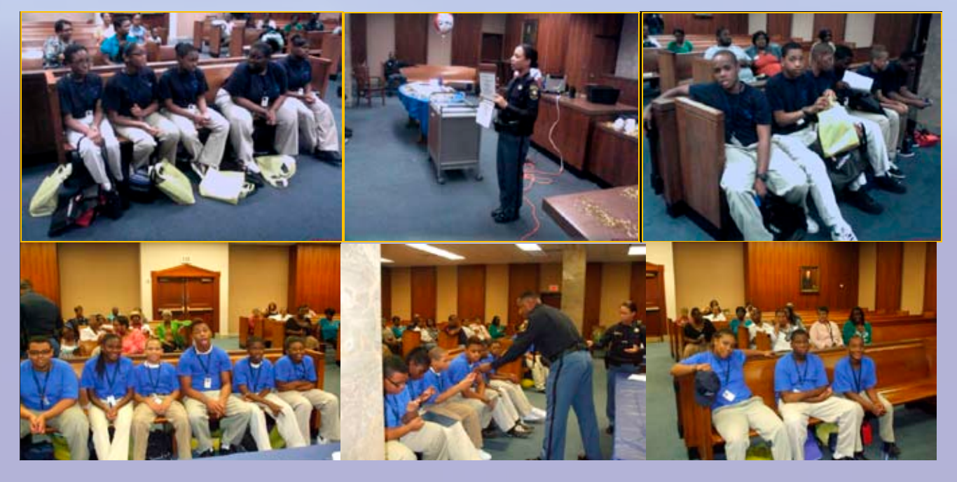
July 26, 2010 Class