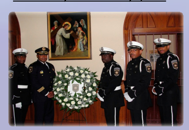
Public Safety Memorial May 6, 2010