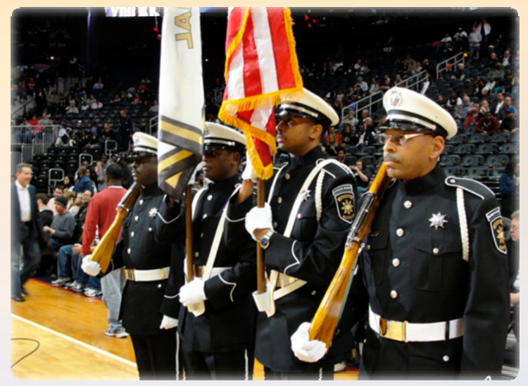
Atlanta Hawks - March 21, 2010