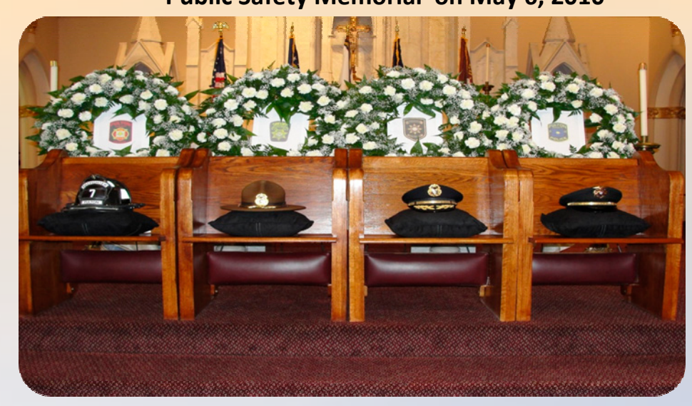
Fire Sheriff Marshal Police