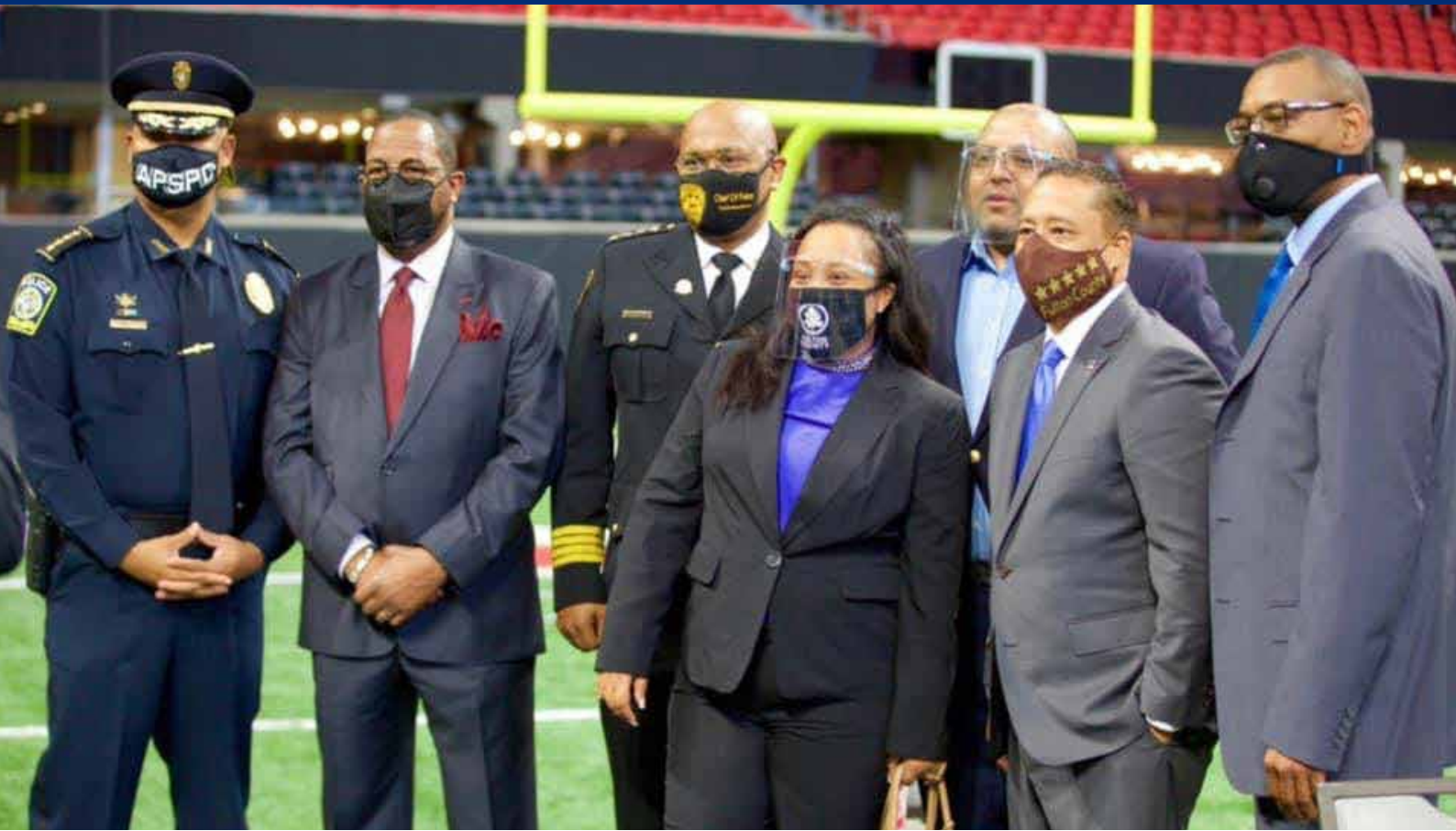
DA Fani T. Willis attended the swearing-in of Fulton County Sheriff's Deputies at Mercedes Benz Stadium.