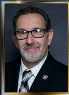
SAUL ALTER CIVIL RIGHTS / ANTICORRUPTION