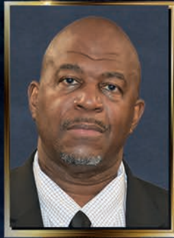
OBED FORD CASR INTAKE